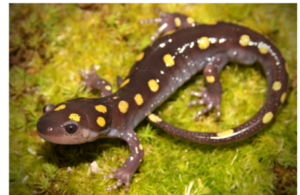
Blue Spotted Salamander

Vermont has ten different species of salamanders! During the day, most salamanders keep from drying out or being eaten by remaining under rocks, logs, or leaf litter. On moist warm nights many of these species can be found out in the open especially around vernal pools.